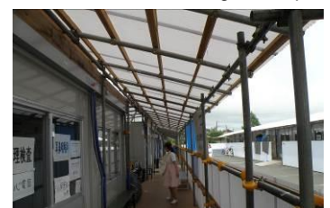
Temporary hospital building