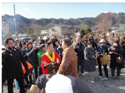
TV crew interviewing the acupuncture therapist