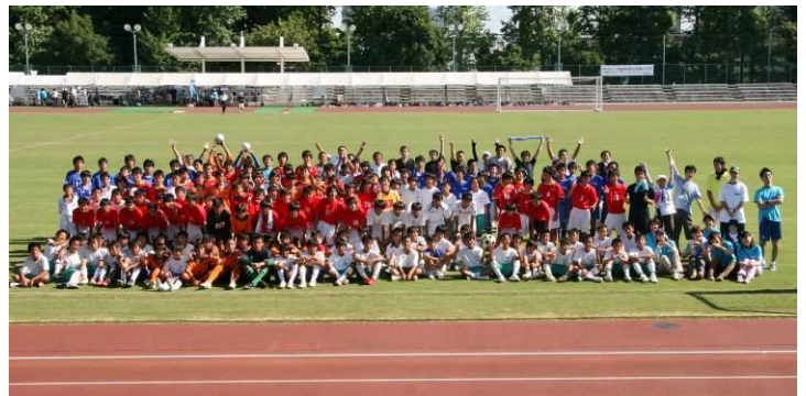
Last day of the event (in Okayama)

Children from Tohoku commented: “I was very happy to be able to play soccer on a beautiful pitch”, “It was wonderful to make new friends”, “I was surprised to know that there is so much sympathy and that there are so many people who care for us”, “I want to find something I can do for other people”, “We were encouraged to do whatever we could toward the recovery of Tohoku.”