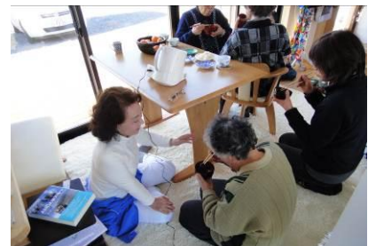
AMDA's volunteer doctor checking blood pressure for the elderly

243 people in total visited the Salon from 15th December 2011 to 13th February 2012. On the opening day, AMDA conducted a questionnaire survey. According to its result, older people want such events as body exercise, yoga lessons and health lectures in the Center, whereas children want to play sports. Staff of the Center will try to listen to the voices of local people and hope to realize their wishes as much as possible, in an effort to contribute to the physical and mental well-being of the people in Otsuchi.