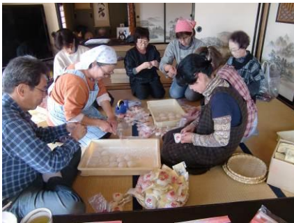
Local people making "mochi" cakes.