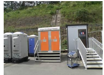
Temporary toilet in Minamisanriku