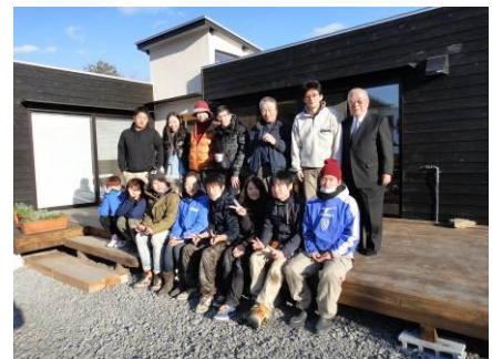
AMDA's staff and volunteers