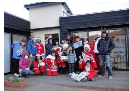
Christmas party for children

AMDA encourages the affected communities in Tohoku to work together toward their common goal of recovery from the disaster. AMDA tries to provide them with opportunities of sharing and exchanging resources to ease and speed up the recovery. This process will help the people to forge stronger bonds among themselves. As the first step, AMDA organized a cultural exchange event for the people in Otsuchi (Miyagi prefecture) and Kesen'numa (Iwate prefecture) early in March, one year after the earthquake and tsunami had hit these cities.