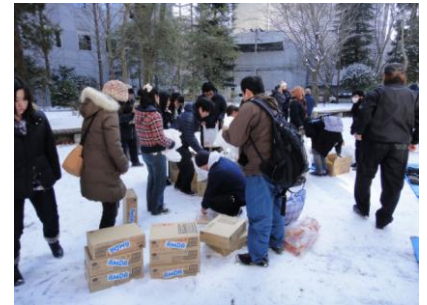
Delivering food in a park in Sendai in January 2012

An increase in the number of homeless has recently become a serious problem in Tohoku. About 100 people in Sendai city are living on the street. After the disaster, these people had come to Sendai to take a job, but as soon as their employment contract expired they were out of work. They became homeless as they couldn't pay for temporary housing and have been taking shelter at Sendai Japan Railway station. To support them survive in the freezing cold weather, AMDA, in collaboration with its donors in Okayama and a local NGO in Sendai, provided them with 300 sleeping bags, 2,000 instant noodles and 2,000 disposable body warmers. Free hot meals were also served in the park. AMDA distributed aid supplies again in mid-March.