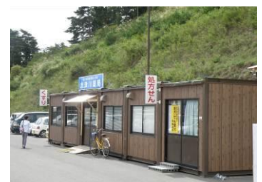
Pharmacy of the temporary hospital