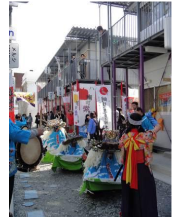
"Usuzawa Shishiodori" parade in Kesen'numa