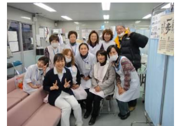
Staff and volunteers at Shizugawa Hospital

"There are some positive changes in the working conditions at the Shizugawa Hospital. For example, hospital office clerks now work as receptionists in the mornings, taking the task over from nurses. Also, the home-visit nursing section is sending three part-time volunteer nurses to the hospital semiweekly, and some volunteer nurses come from Sendai twice a week. Despite these extra staff, the number of holidays for nurses has not changed significantly since last summer. A local nurse told me, 'If I could take a few days off, I would be able to recharge myself.' The shortage of local doctors was a serious problem. There were just two or three physicians on duty each day. Due to the shortage of doctors, patients often have to wait over two hours, which is burdensome to the elderly. I saw the patients and their attending families get exhausted when