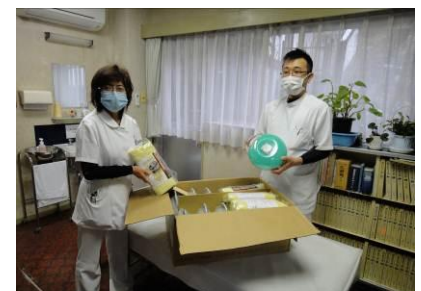
Hospital staffs receiving hot-water bottles and blankets.

Hospitals in the affected area are still on their way to recovery. AMDA sent four beds to one of the hospitals in Kesen'numa. Hot-water bottles and blankets, which were given to AMDA by its donors, were also delivered to this hospital.