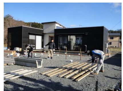
Setting up wooden deck in front of the Center