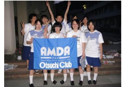
High school students in Otsuchi supporting AMDA

for the affected regions in Tohoku by raising funds and volunteering. AMDA will support these High School Clubs in Okayama and Otsuchi help organize Sports and Cultural exchange programs.