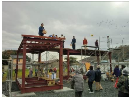
Throwing "mochi" on the frame-raising ceremony