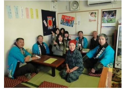
People from Otsuchi and Kesen'numa

People in Kesen'numa told AMDA: "Today I got lots of good energy and encouragement from the people of Otsuchi. I don't want this to be a one-off event", "I immediately felt something in common with people from Otsuchi. I felt tears in my eyes", "Talking with people who experienced the same disaster is consoling", "Next time we want to visit Otsuchi and perform our music and dance." A person in Otsuchi sent a message to AMDA: "It will be great if this bond between Otsuchi and Kesen'numa would expand into whole Tohoku and if people would work together hand in hand. Today was the first step toward this goal."